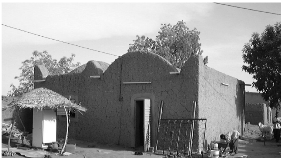
Spontaneous house construction by trained builders in Niger using local available earth bricks.

The World Habitat Award seeks to identify human settlement projects that offer sustainable futures to residents and which present practical solutions to current problems.